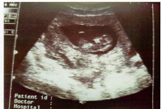
12 weeks fetal development